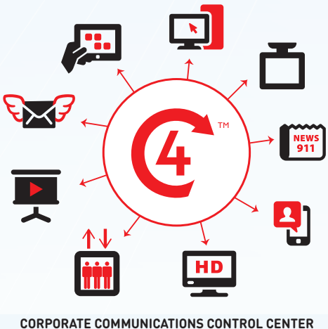
ORPORATE COMMUNICATIONS CONTROL CENTEI (C4<sup>™</sup>) MAKES IT WORK!

X-Factor's powerful desktop messaging product also integrates with dscp:// for a comprehensive emergency notification platform. Once emergency notifications are entered into dscp:// a single system, the message is sure to be seen throughout your employee community. Based on configuration, these messages will be displayed on digital signs, all desktops via the desktop play and screensaver, intranet sites, IP phones, mobile phones and mobile devices, and targeted email - all while being monitored from a central operations center.